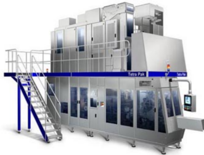
Tetra Pak® A3/Flex