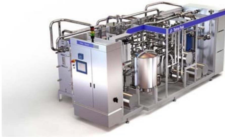
Tetra Therm® Lacta